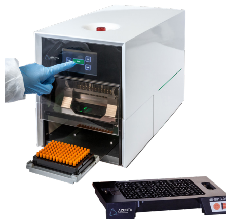
Capper & De-capper for 96, 48 and 24 format Screw Capped Tubes